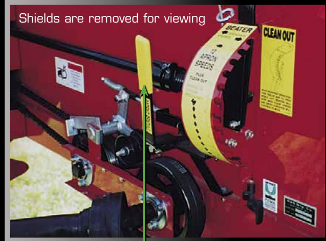
Shields are removed for viewing

A simple trouble-free variable speed drive lets you match just the right unload speed to the crop type, load condition and blower capacity.