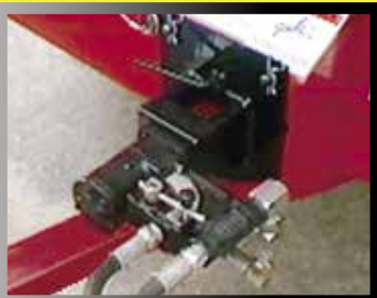
Front hydraulic drive is optional.