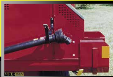
The twin augers extend 11" beyond the side of the head. A built in auger extension is standard and eliminates spillage between box and blower.