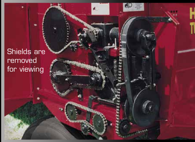
Shields are removed for viewing